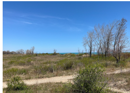
Illinois Beach State Park